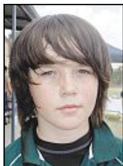
ANDREW Symonds. He plays like an old-fashioned gentleman.