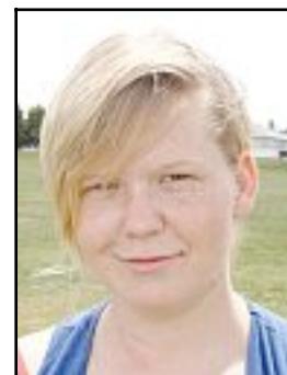
ANDREW Symonds. He is awesome.