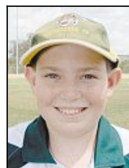
RICKY Ponting. He is one of the best ever Australian captains.