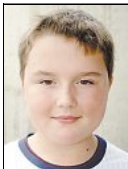
MY dad, because he taught me how to play.